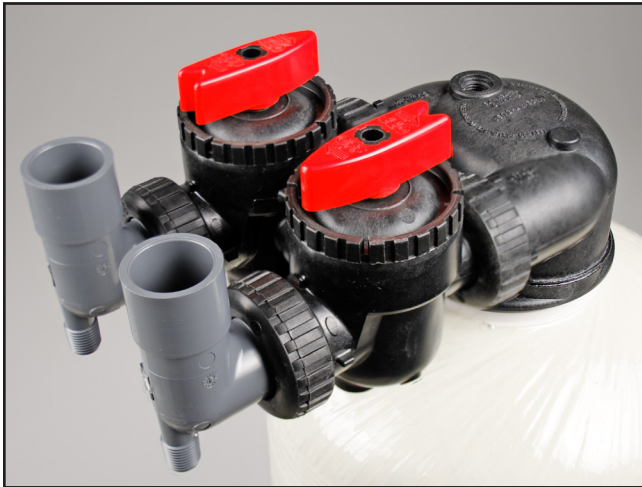
1191 In-Out Head shown with optional V3006 Bypass Assembly and V3007-01 3/4" x 1" PVC Solvent Elbow Assembly