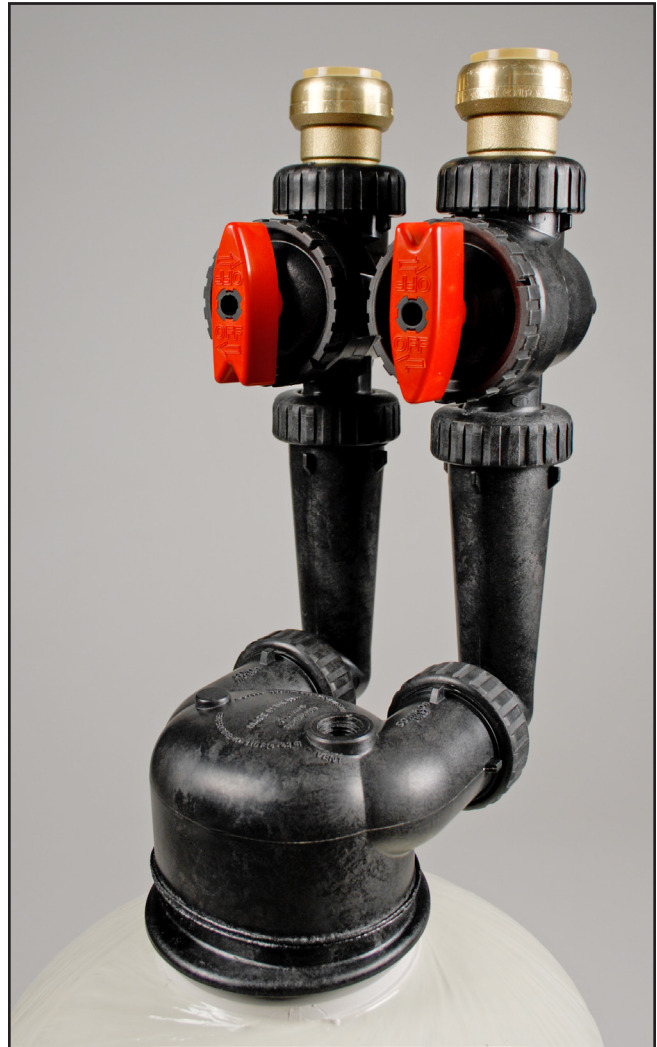
1191 In-Out Head shown with optional V3191-01 Vertical 90° Adapter Kit, V3006 Bypass Assembly and V3007-13 1" SharkBite® Fittings